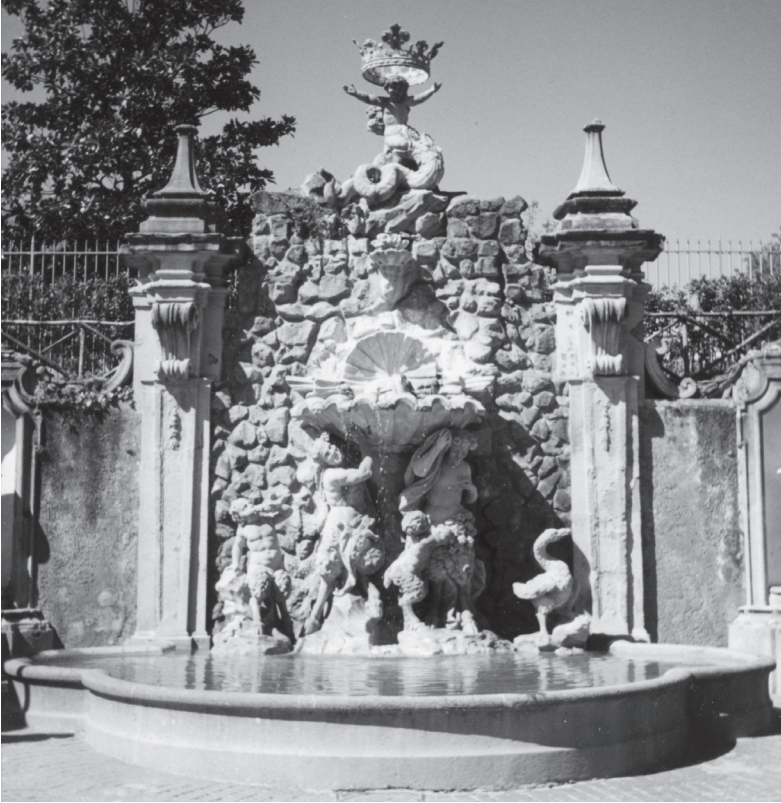
Early eighteenth-century fountain in the garden of the Villa Sciarra, which inspired Wilbur's poem "A Baroque Wall-Fountain in the Villa Sciarra."

"A Baroque Wall-Fountain" suggests the existence of a bliss as truly humble as the one Saint Francis imagined: a level in which human beings accept kinship with the blameless but God-created things of our world—the water and grass and sunlight that might be undervalued as inanimate. Analogous use of this saint's sense of kinship also animates "For the New Railway Station," where the "least shard of the world sings out / In stubborn joy" at the astonishing rebuilding project that culminates in the construction of heaven from human imagination and earthly materials. Both endings move quietly through well-prepared and well-argued revelations toward final resolutions in which seemingly discordant ways of living reconcile. Wilbur imagined his paradise, but the materials with which he built it are, as his poems insist, things of a world he shares, not imposes.